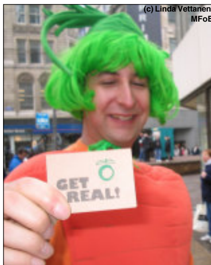
Manchester Friends of the Earth, dressed as carrots, launch their online guide to real food. http://www.realfoodguide.org.uk

March was "veggie month" and Manchester Animal Protection held a food fayre with over 200 people visiting on the day. The majority were meat/fish eaters curious to find out more about vegetarian and vegan diets and to sample some meat-free and dairy-free food. There were also a number of committed vegetarians interested in taking the extra step of giving up dairy products and eggs, because of the inherent cruelty in the dairy and egg production industries.