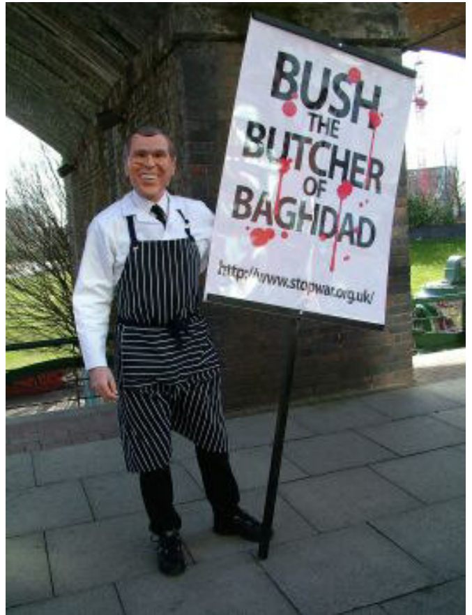
This month's campaign camera is from the protests outside the Labour Party's Spring Conference

held in Manchester in the middle of March. More on pages 1,2,3 and 10.