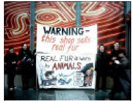
Earlier protests outside the Manchester Harvey Nichols store

Some rabbits are bred solely for their fur and those farmers who breed rabbits primarily for their meat also sell the fur to make the business profitable. CAFT is also concerned that the sale of rabbit fur promotes the use of all fur.