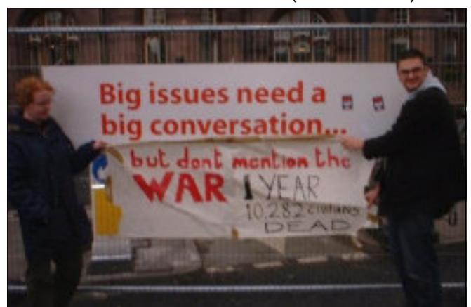
Protesters decide to enhance posters around the Labour Party's Spring Conference (see p1-2)