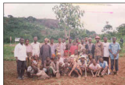
VOT members Sierra Leone

VOT ( veganorganic@supanet.com ), http://www.veganorganic.net